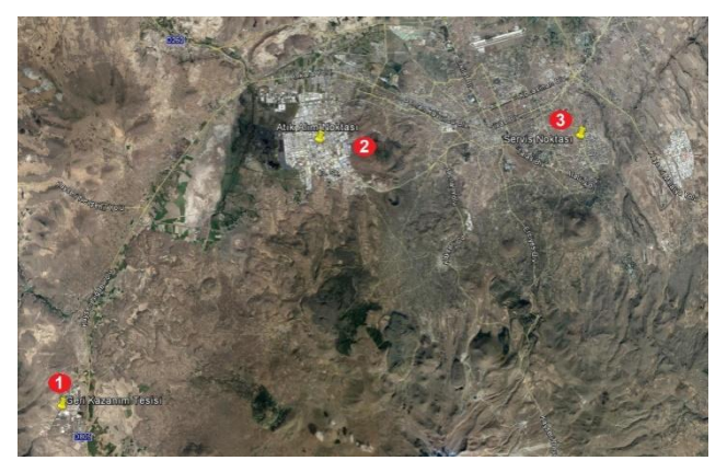
Figure 1. The location of Waste Recovery Facility (1), waste collection points (2) and settlements of workers (3).